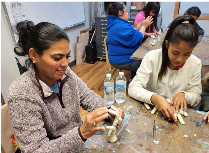
A mother and daughter create small sculptures during a night-class at the LUX Center.

Partners: El Centro de las Américas, Lux Center for the Arts