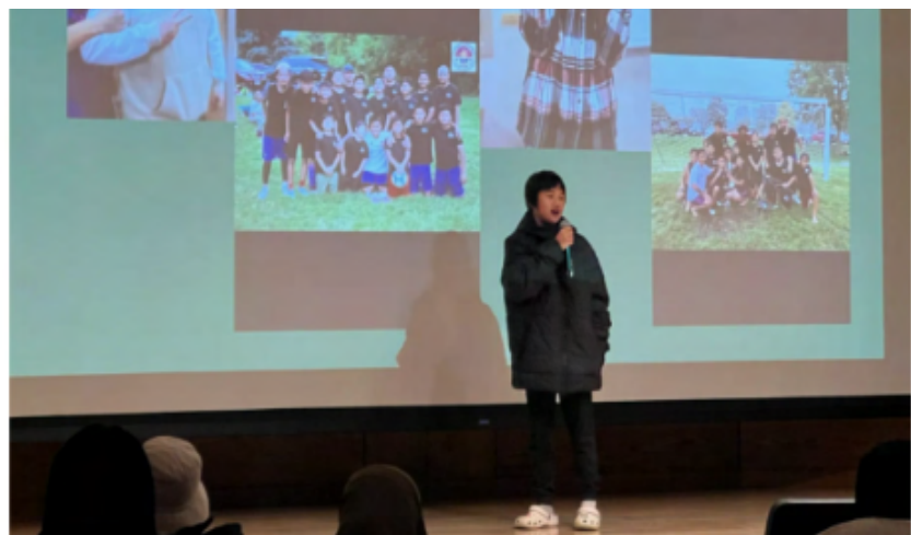
A student sharing with the community about a transformative experience using photos and digital media as part of the Asian Community & Cultural Center's Untold Migrant Stories project.

Untold Migrant Stories is a digital storytelling program for refugee and immigrant youth in Lincoln that encourages students to document their lived experiences and share them with the public through community showcase events. Through this project, students learned photography