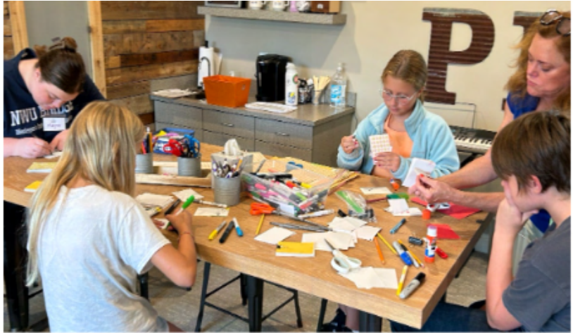
“Art From Our Heart” participants explore the development and movement of grief through a crafting project designed to encourage reflection on their healing journey.

Mourning Hope. In partnership with The LUX, Mourning Hope offered four community-based “Art from Our Heart” programs to Lincoln’s bereaved children and teens at the Mourning Hope Grief Center in June, July, September, and December 2023. To develop and nurture children's personal growth, grieving youth were connected with local artists for an expressive media project focused on emotional healing.